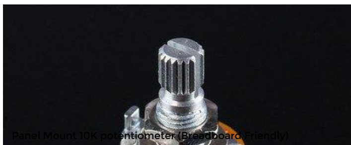
Panel Mount 10K potentiometer (Breadboard Friendly)