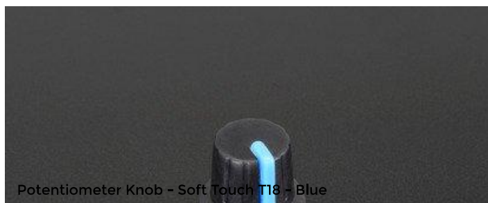
Potentiometer Knob - Soft Touch T18 - Blue