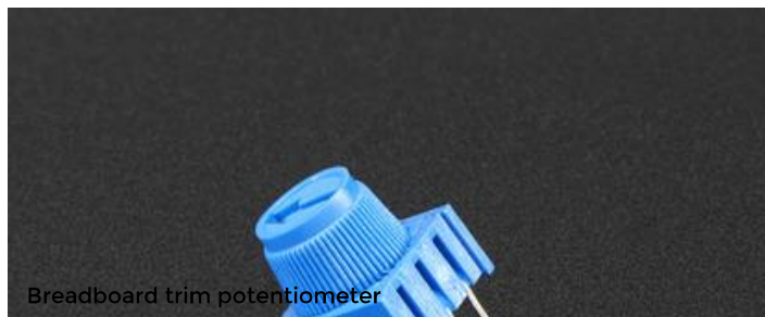
Breadboard trim potentiometer