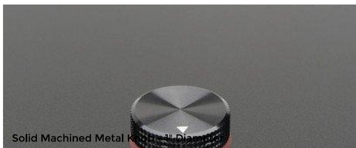
Solid Machined Metal Knob - 1" Dia