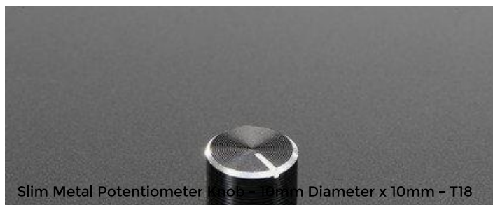
Slim Metal Potentiometer Knob - 10mm Diameter x 10mm - T18