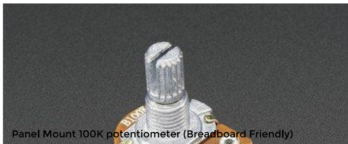
Panel Mount 100K potentiometer (Breadboard Friendly)