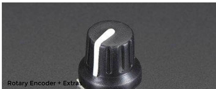
Rotary Encoder + Extras