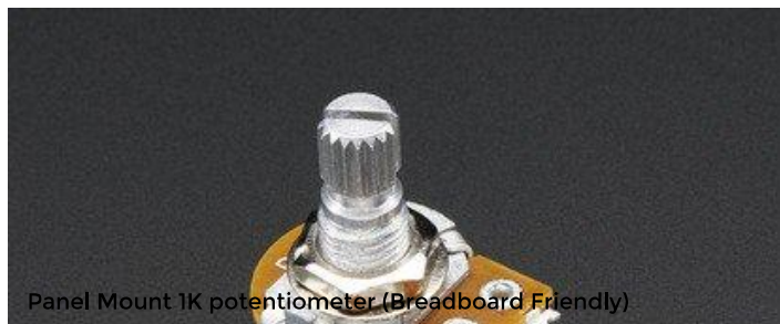
Panel Mount 1K potentiometer (Breadboard Friendly)