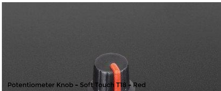
Potentiometer Knob - Soft Touch T18 - Red