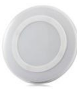
Qi Wireless Charger Charging Pad for Samsung S6/S6 Edge/Nexus6 - White CHF5,05 (63 Reviews)