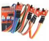
DIY 4-CH Traction Control System for R/C Smart Car / Robot - Red (DC 3.3~5V) CHF5,31 (0 Reviews)

There are no reviews yet, write a review and get DX points! What are DX points?