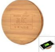
Universal Round Shaped Bamboo Qi Wireless Charger - Wood Color CHF10,78 (2 Reviews)