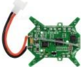
JJRC H6C-06 Replacement DIY Receiver Board Module for JJRC H6C - Green CHF10,26 (0 Reviews)