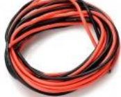
DIY 18AWG Silicone Wires for R/C Airplane - Black + Red (2PCS / 2m) CHF4,66 (0 Reviews)

Please note that DealExtreme Forums are not a sales or product support board. For support questions, please contact us via support ticket at http://cs.dx.com/ for a guaranteed response. We make every effort to make the quickest replies.