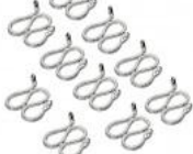
MOXO C7893 DIY Snake Style Iron Connection Toy - Silver (10PCS) CHF4,88 (0 Reviews)