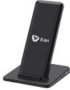
A15 5W Wireless Charger for Samsung S6 Edge / Note 5 / S7 - Black CHF14,71 (0 Reviews)