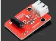
DIY Vibration Switch Sensor Module for Arduino - Red CHF2,45 (0 Reviews)