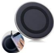
Qi Wireless Charging Pad for Samsung Galaxy S6/S6 Edge/Nexus 6 - Black CHF3,80 (63 Reviews)